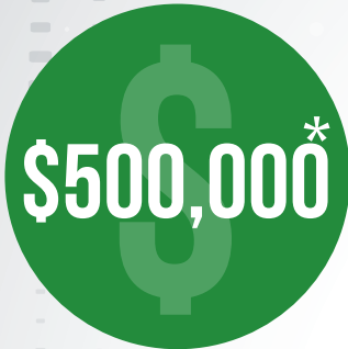
Total amount donated to charitable organizations