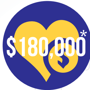
Total dollar amount of grants in 2013