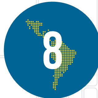
Total number of grants in LATAM