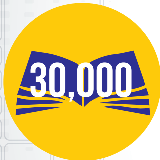
Books distributed to students in need