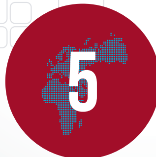
Total number of grants in EMEA