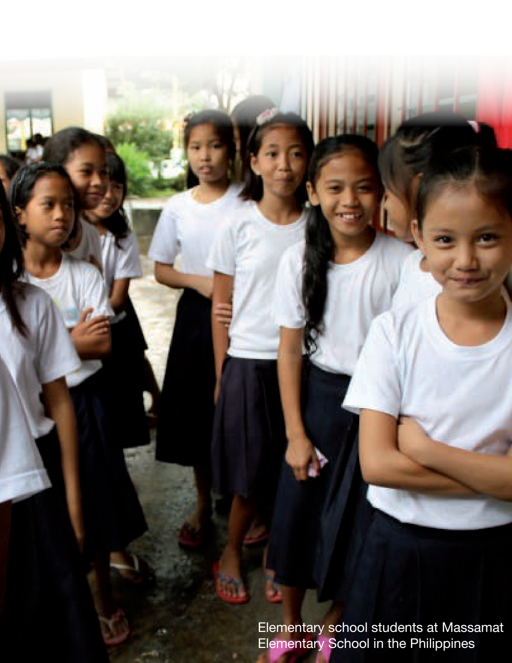
Elementary school students at Massamat Elementary School in the Philippines