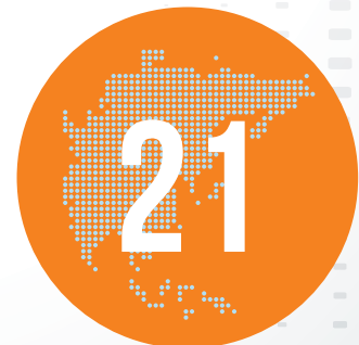
Total number of grants in ASIA-PAC