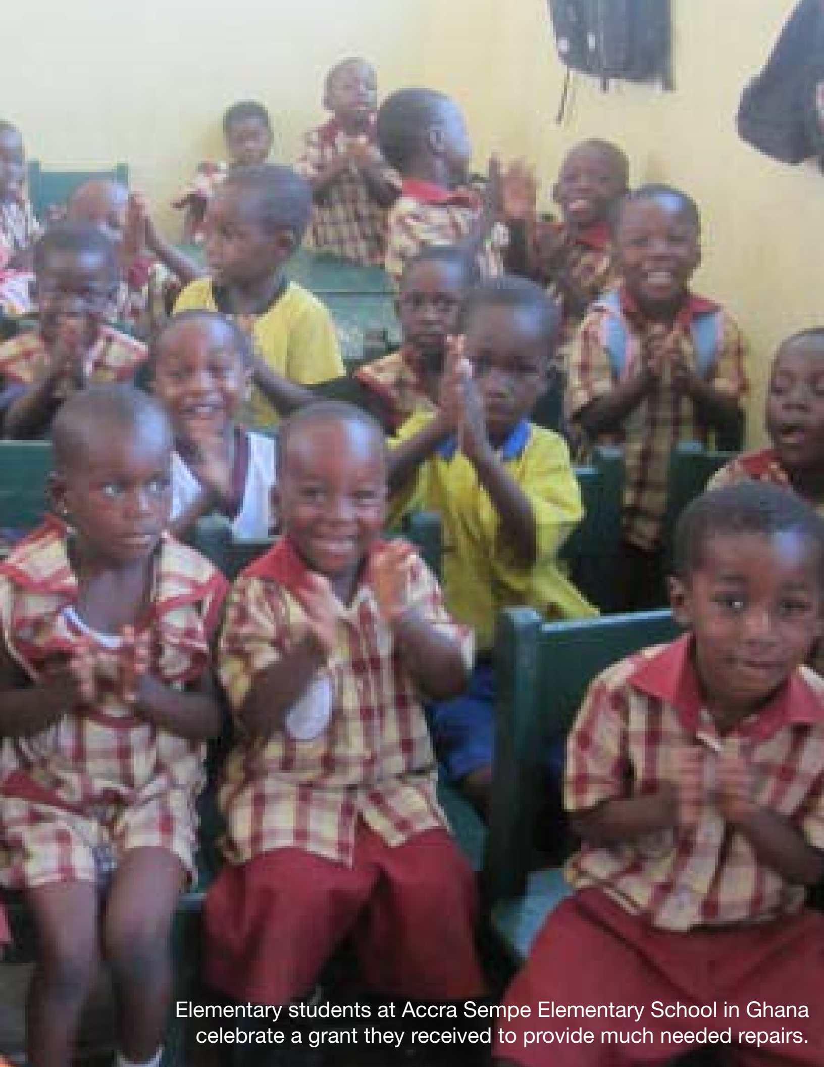
Elementary students at Accra Sempe Elementary School in Ghana celebrate a grant they received to provide much needed repairs.