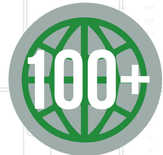
Organizations supported globally