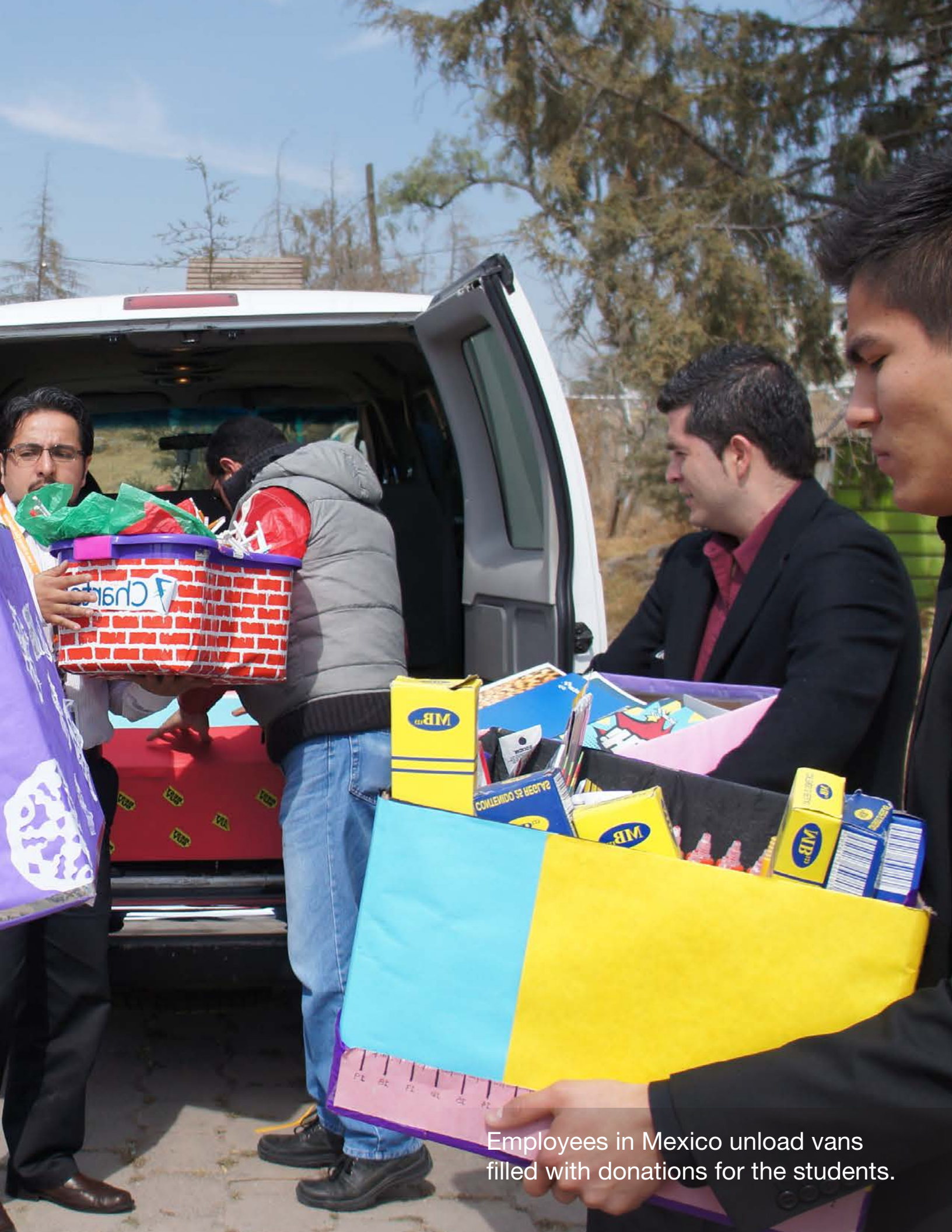
Employees in Mexico unload vans filled with donations for the students.