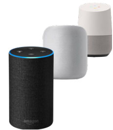
In-App and Web